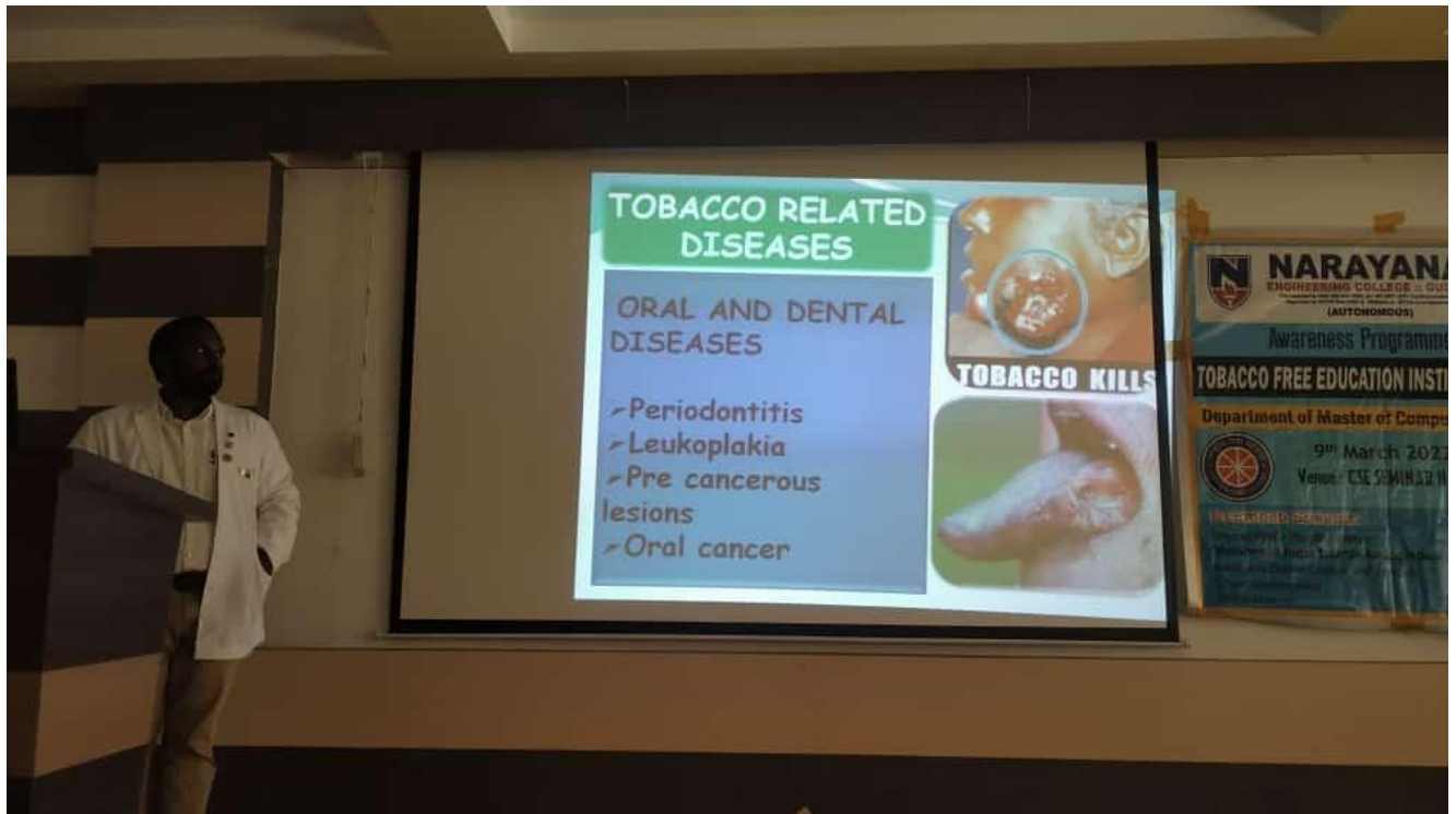
Resource Person Dr.Embeti Srikanth ,MDS Presentation on Awareness of Tobacco Consumption